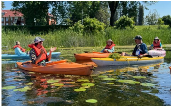
Mi Paddle Steward participants learn how to identify native and non-native aquatic plants locally in the Thunder Bay River.