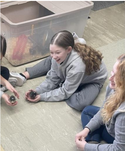
Embryology in our schools

A new special interest (SPIN) club was introduced this year, centered around the fun and tactical game of chess! Participants met weekly to challenge their opponents and enjoy friendly competition.