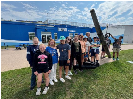
4-H Great Lakes and Natural Resources campers explore fisheries and maritime history science and careers.