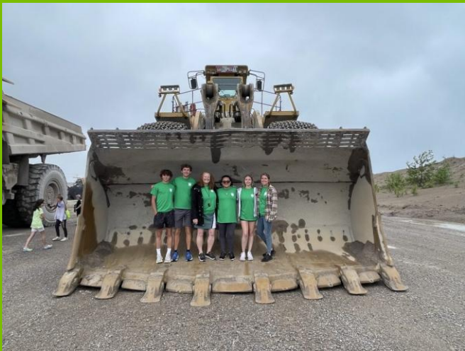
Our awesome counselors and directors!