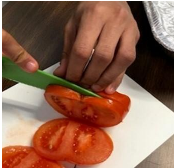
A student demonstrates "The Claw," which is a safety skill taught during "Teen Cuisine."