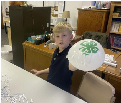
Aftercare at a local school.

Presque Isle youth were trained in lifesaving skills - CPR & First Aid, during three separate babysitting clinics held throughout the county this year.