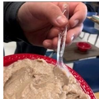
"Rock and Roll Ice Cream" is a popular recipe. Students are always surprised to learn they can make healthier, cost-effective versions of their favorite treats at home (or in the classroom).