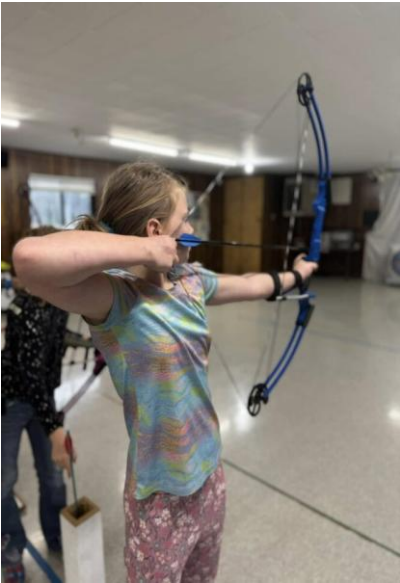
Our Archery program still has a strong presence in the community.